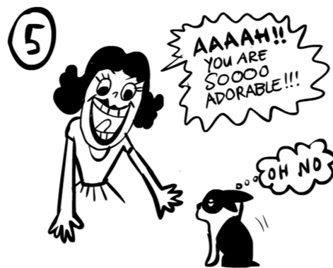
DON'T Squeal or shout in his face