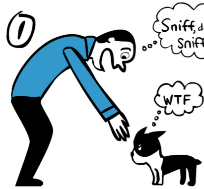
DON'T Lean over the dog & stick your hand in his face

Most people do this stuff and it stresses dogs out so they BITE! I don't care how cute you (or your kid) think Boogie is. Please show him some respect.