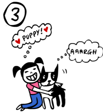
DON'T Grab or Hug him