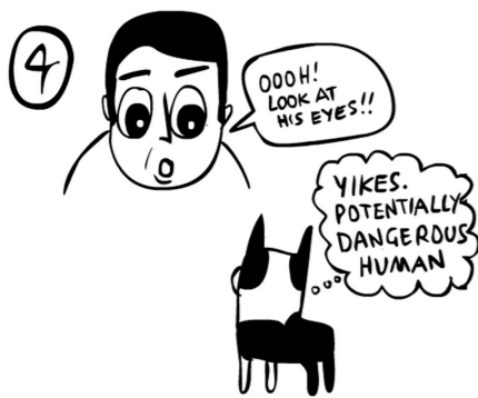
DON'T Stare him in the eye (This is an adversarial gesture)