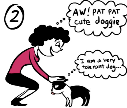
DON'T Lean over the dog & stick your hand on top of his head