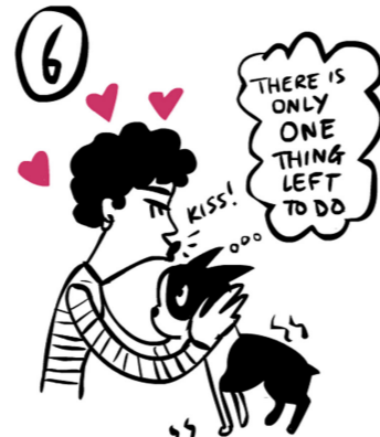
DON'T Grab his head and kiss it (This is an invasion of space)

Doing this to a dog who doesn't know you is like a perfect stranger giving you a great big hug and kiss in an elevator. Wouldn't that creep you out? And wouldn't you have the right to defend yourself?